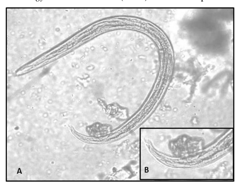
Fig. 2 A - Aelurostrongylus abstrusus larva (100X). B – Dorsal spine on the tail (400X)

only Puma yagouaroundi was positive for this lungworm (14.3%). The larvae (Fig 2) were detected only by the sedimentation method, showing, on average, five L1 per slide.